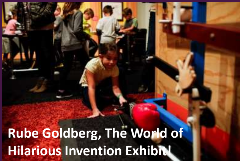
Rube Goldberg, The World of Hilarious Invention Exhibit!