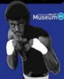
Exhibit Closed on September 18 th .

Explore the exhibit and see the full-length documentary: 'The Forgotten Fighters of the Kalamazoo Boxing Academy'